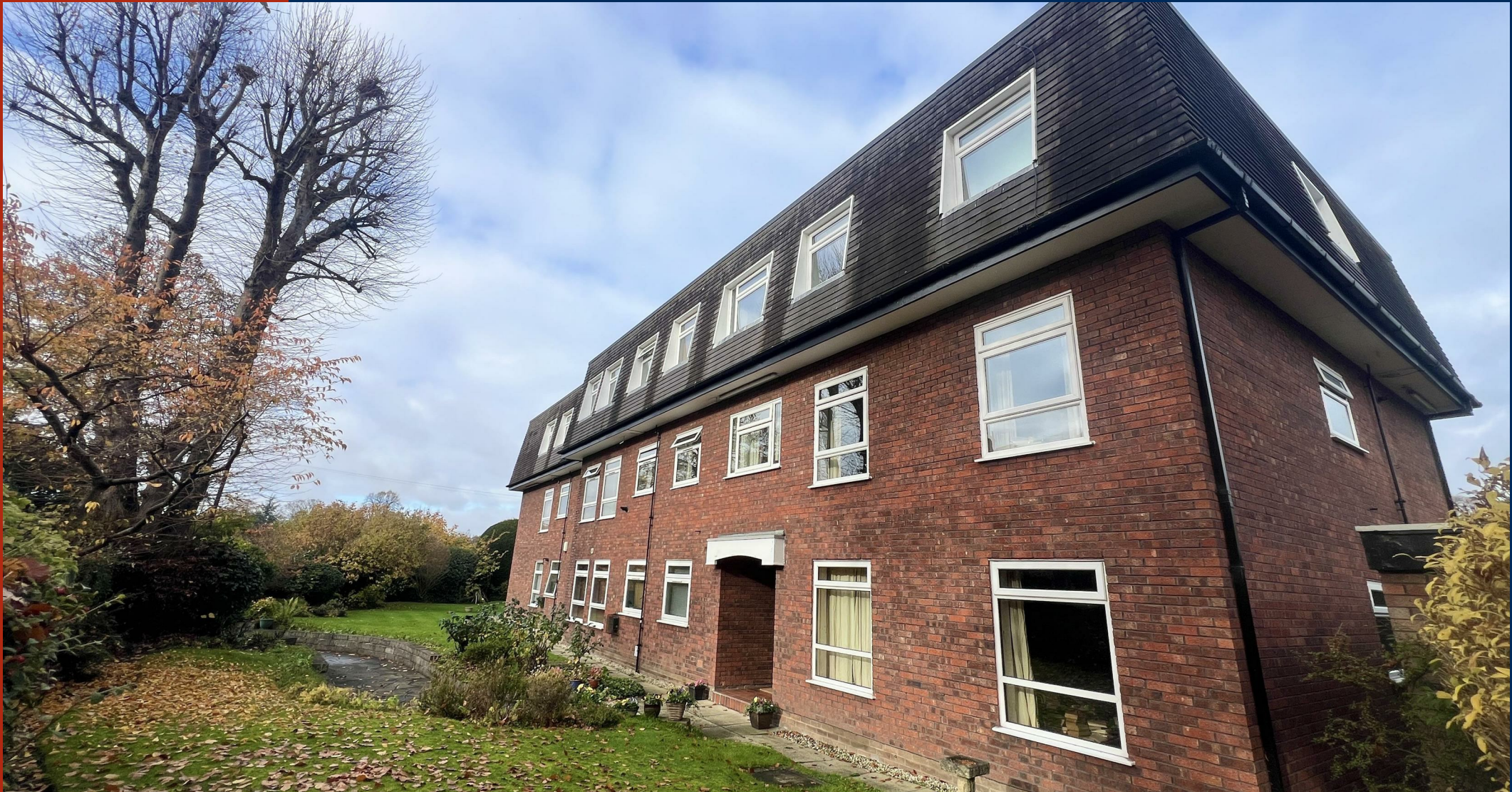
Flat 13 The Sycamores, Sale, M33 3WH